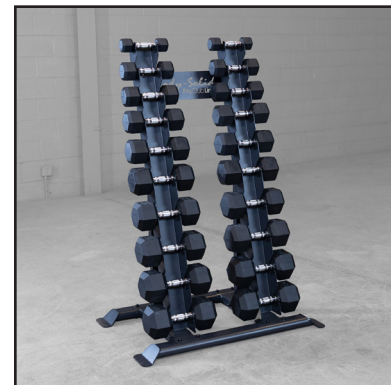
Dumbbells sold separately