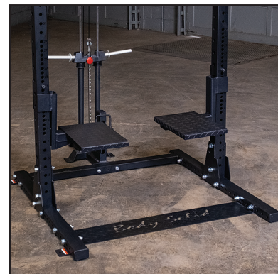
SPR500 and other attachments sold separately. SPRSP Spotter Platforms will fit onto SPR500 or SPR1000 Racks